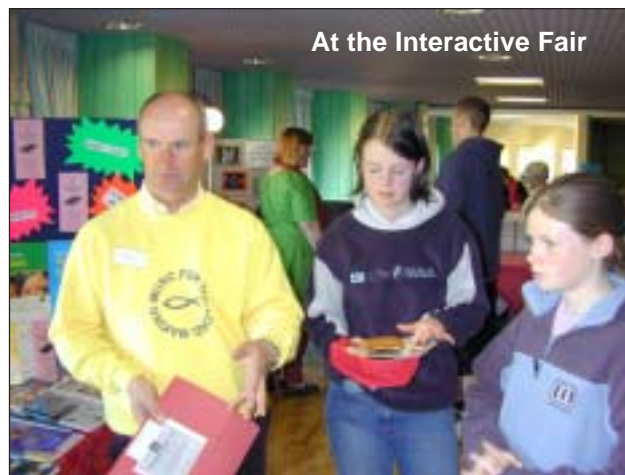
At the Interactive Fair

“We’ve learnt that Sunday worship is to nourish us to go out and look for God’s needs in the community and roll up our sleeves and tackle them, and I hope that’s what we’re all going to do.”