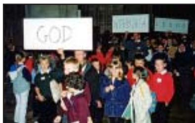
One of the 2002 Cathedral Days

Booking for the Church Schools Cathedral Days has already closed, with demand for