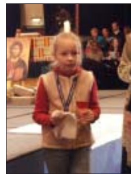
A child administers the chalice at the Sunday Eucharist

An introductory leaflet is also available.