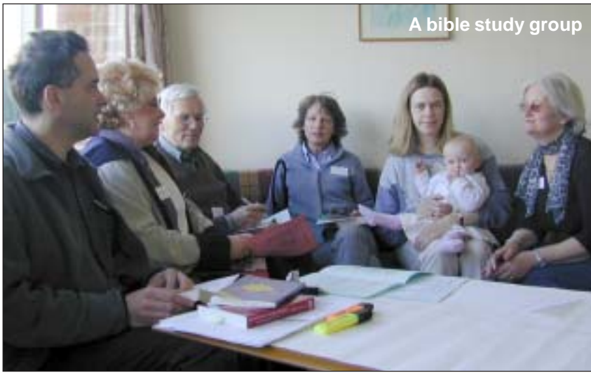
A bible study group

“Coming from a small parish it’s great to meet so many people from across the diocese, but above all it’s to understand that God is at work whether it’s in the third world or the inner-city or fenland.”