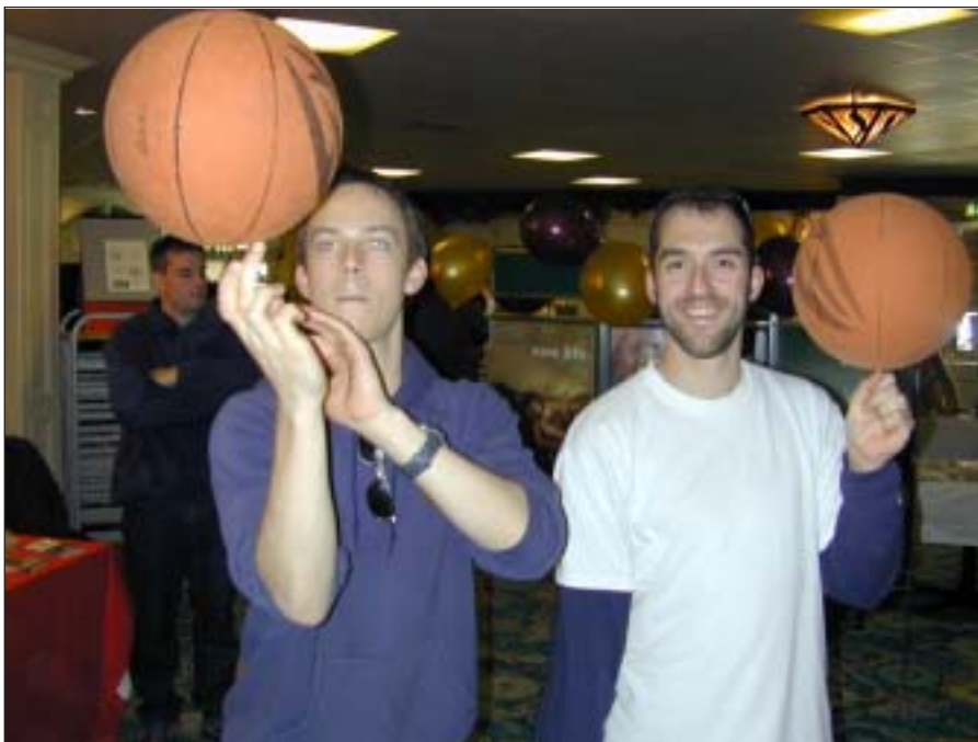
Some of "Fly Basketball team" at the Interactive Fair at Odyssey 2

There are more copies of this book at the Resources centre. If you want your own copy, the ISBN is 1 85999 170, costs £7 and is available from Scripture Union.