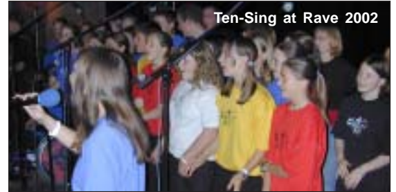
Ten-Sing at Rave 2002

... and finally, FREE giant (and I mean 'big!') balloons will be falling from the Cathedral's Octagon roof onto the dance floor below during the final hour of the event!