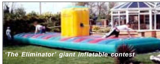
'The Eliminator' giant inflatable contest

'Internet-linked Computers', 'The Eliminator' giant inflatable contest, Charity Stands, Circus